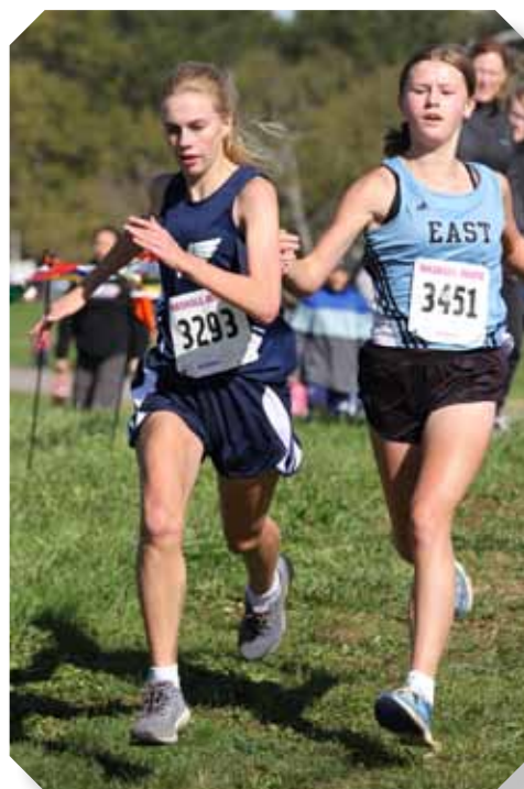
Sprint to the finish in the Girls Varsity Race.