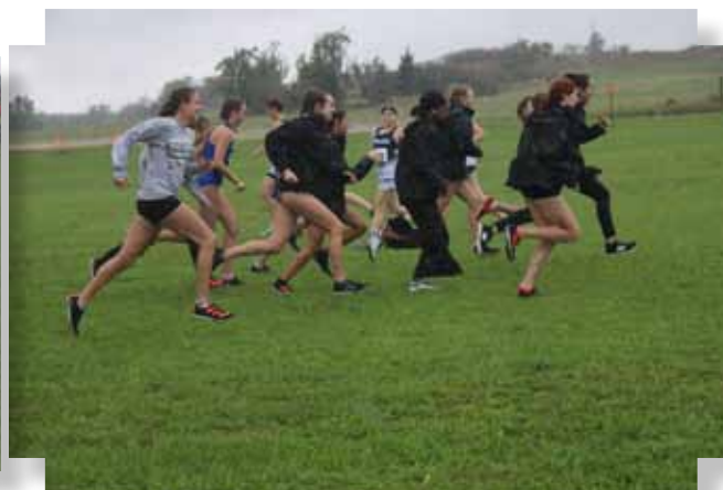
Warming up in the Rain