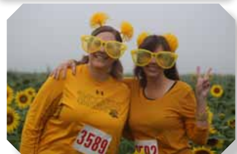
Here's to Looking at You!