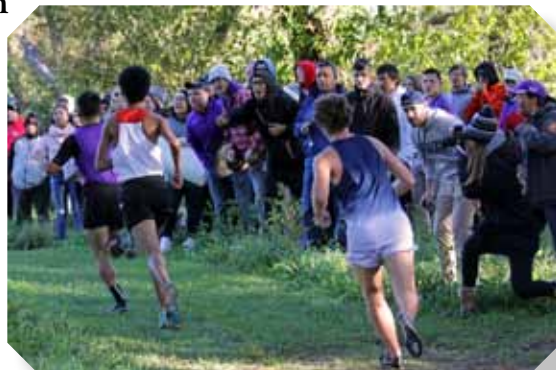
Always a tradition at cross country races is the enthusiastic support of family and fans along various points on the course. Fans run quite a bit to go from one vantage point to the next.