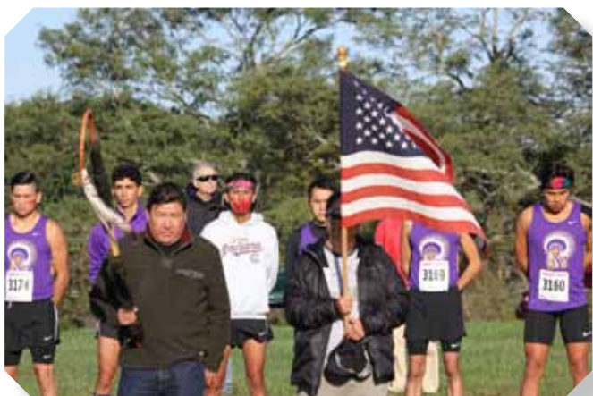
flagceremony - a tradition at Haskell Indian Nations University races is the Native American version of flag ceremony before the race. Here, the flag and staff holders stand in front of the Haskell team members while off to the side is the singer and his drum.