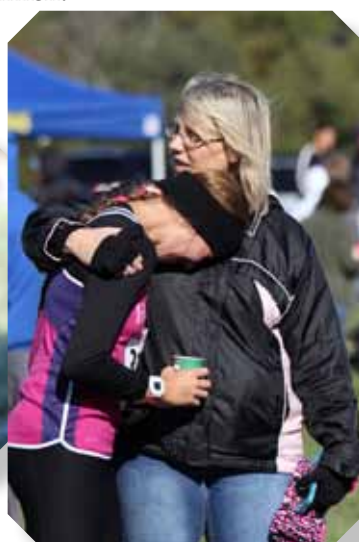
Some days are tougher!