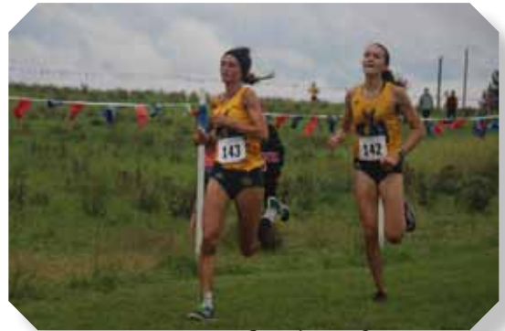
two Roos finishing fast in 3rd&4th place)