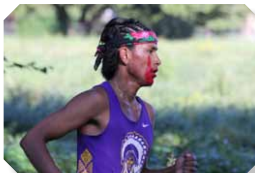
this was the one Haskell runner who painted a red hand over his mouth.