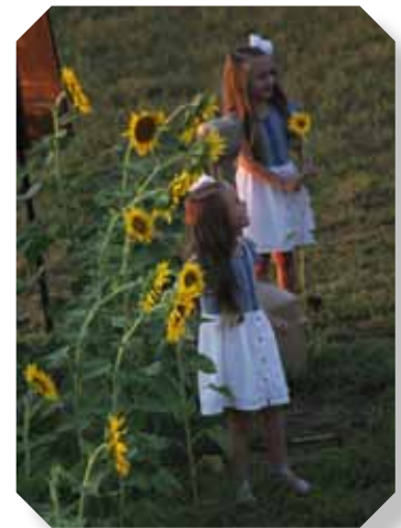
Sweet Sunflower Girls