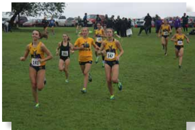
Hoppin' Roos ready to go

The Jayhawks were dominant against 9-10 other teams, although they got a run for the top prize from UMKC and from the unattached group. Athletes and spectators had to spend time in their vehicles during a two-hour lightning storm delay.