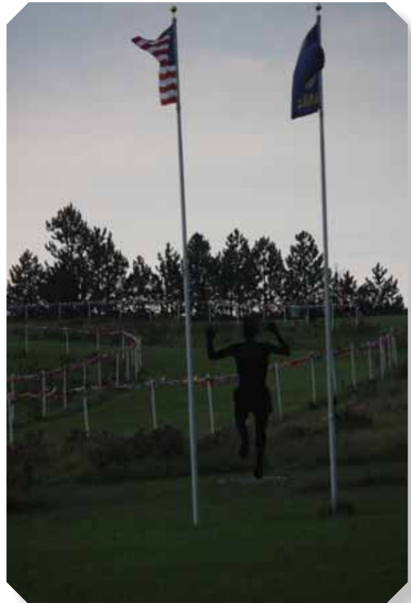
Billy Mills wins again!